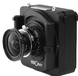
One back extender