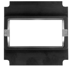
6x12 camera back with focusing screen