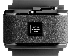
6x12 roll film holder