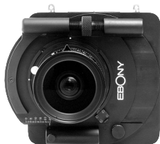
25mm Lateral shift