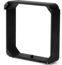
Camera back extender