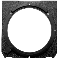
Finesse Mount L Linhof-type: allows lenses to be used with other view cameras