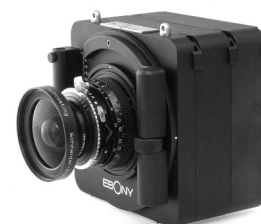
Two back extenders